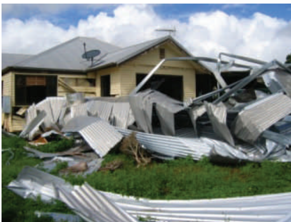
Flying debris resting in front of a house

Other outdoor objects and equipment such as air conditioning equipment, hot water tanks, swimming pool equipment, solar water panels, satellite dishes, antennas and similar objects may be blown around in a cyclone and can become flying debris that could impact your house or other houses in your neighborhood. You should ensure that all equipment is not loose and that it is properly fixed.