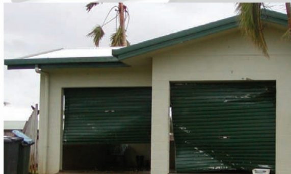
Damage to garage doors.

It is common to see garage doors fail when they are pushed in or out by strong winds.